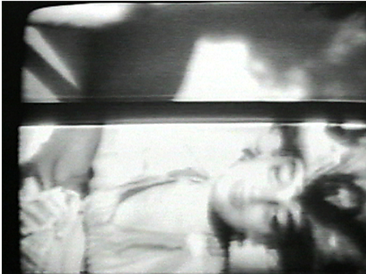
Fig 7. Joan Jonas. Organic Honey's Vertical Roll (1973). Video, black and white. Jonas intentionally misaligns the vertical hold in the video camera to create a sense of distortion and failure.

tube in real time and thus inscribing in it the calligraphic abstractions of light, while in Bird's Eye she aimed a laser directly at the camera lens, producing an analogous but visually distinct effect.