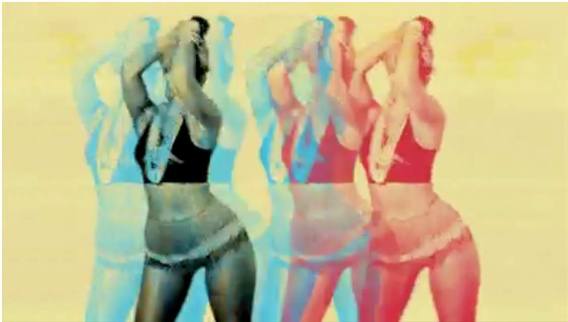
Fig 1. Rihanna. Rude Boy. Music Video. Directed by Melina Matsoukas (2009). Colored glitches and static create trendy visual effects.

errors—has become increasingly prevalent in media, art, design, and commercial landscapes. 1 Why and how have glitch aesthetics achieved this ambivalent status?