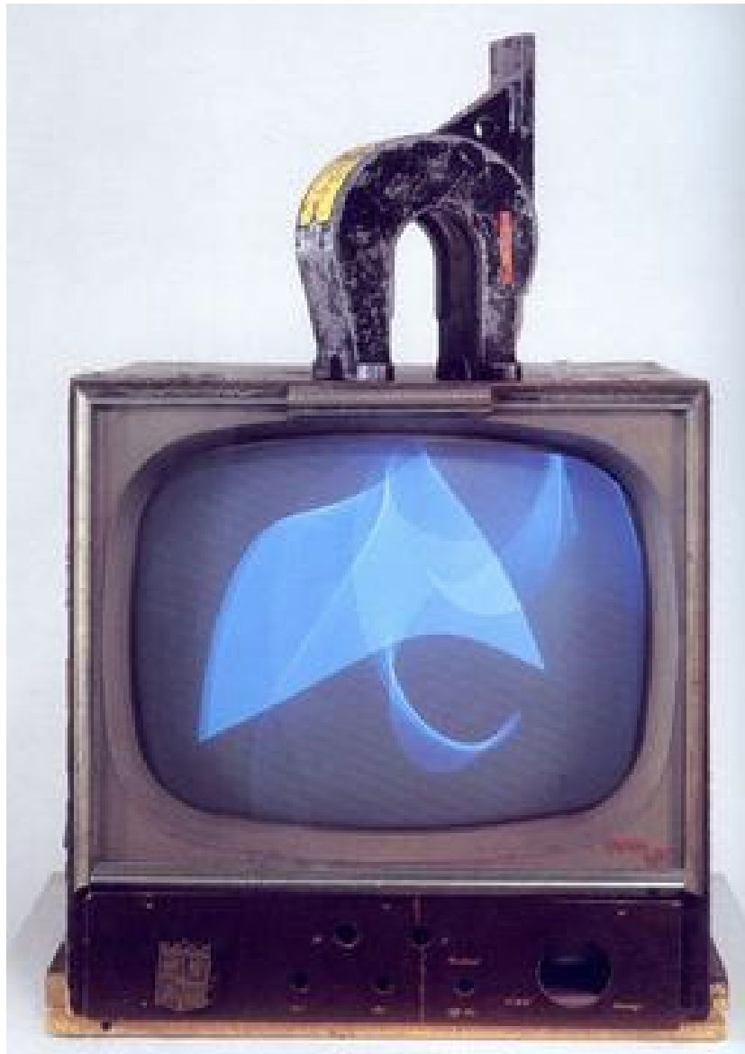
Fig 6. Name June Paik, Magnet TV (1965). Using a magnet, Paik distorted the otherwise “clean” televisual signals.

If glitch, error, and noise have consistently been framed as Other within Western aesthetics, what better companion to this project of critique than feminist praxis: also marginalized as the “Other” within the long history of Western culture and patriarchy?