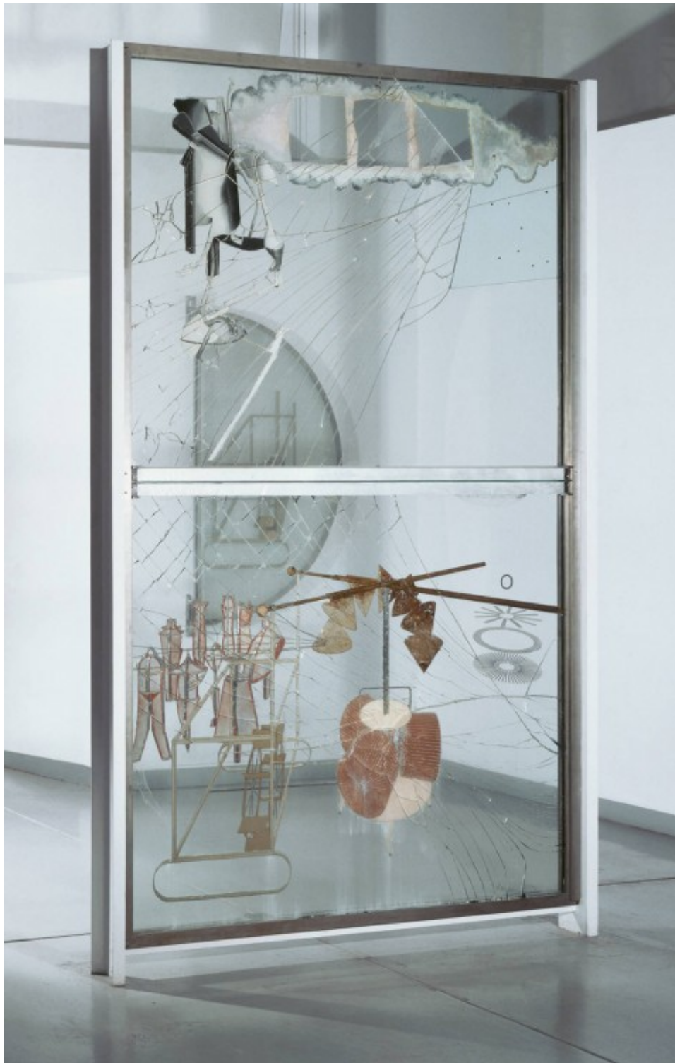
Fig 5. Marcel Duchamp's The Bride Stripped Bare by Her Bachelors, Even (1915-23). After the glass accidentally broke, Duchamp declared the work was finally complete. Image courtesy of ARES and the Museum of Modern Art.

Because the Large Glass does not depict a glitch by way of another medium , as with Nude Descending a Staircase or the other paintings noted above, the glitch here is the art—namely, art's ability to act as a bearer of its own "content." In other words, content and frame are inextricably bound. The process of looking at and through the broken glass becomes just as